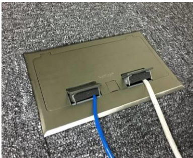
For Plug Type A/B